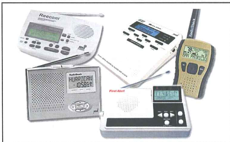
Selection of NOAA Weather Radio receivers available at electronic retailers.