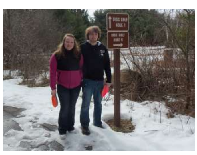
Disc Golf is not just a summer game!