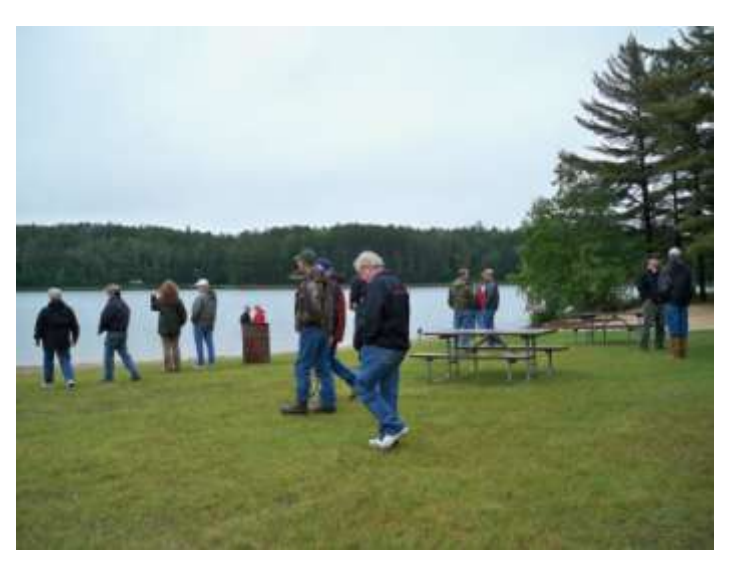
Boats & Canoes Perch Lake is a non-motorized lake. A boat landing is located on the west side of the lake. No swimming is allowed at the park.