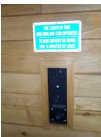
Coin Operated Lights