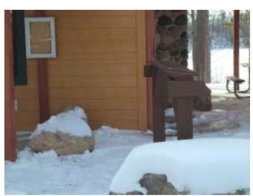
Winter Ski Rack