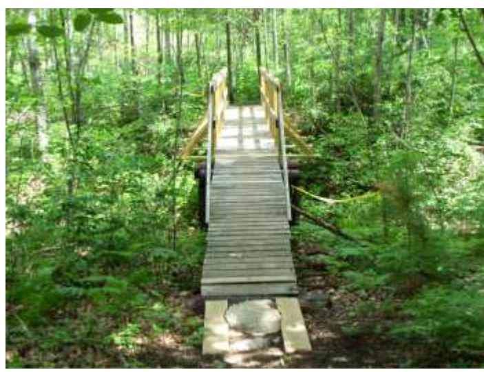
Single Track Bridge

Silent Sports Trails Perch Lake Park serves as a trail head for the Washburn Trail, which is the largest and most popular of the 3 ski trails, located adjacent to Perch Lake Park in the Town of Woodboro. The Washburn Ski Trail is 12.0 miles long, offering 4.0 miles of trail groomed for tracked skiing, and 8.0 miles of trail groomed for ski skating. As a result of the hilly topography found throughout the Washburn Lake Area, these ski trails are best suited for skiers possessing an intermediate to advanced skill set.