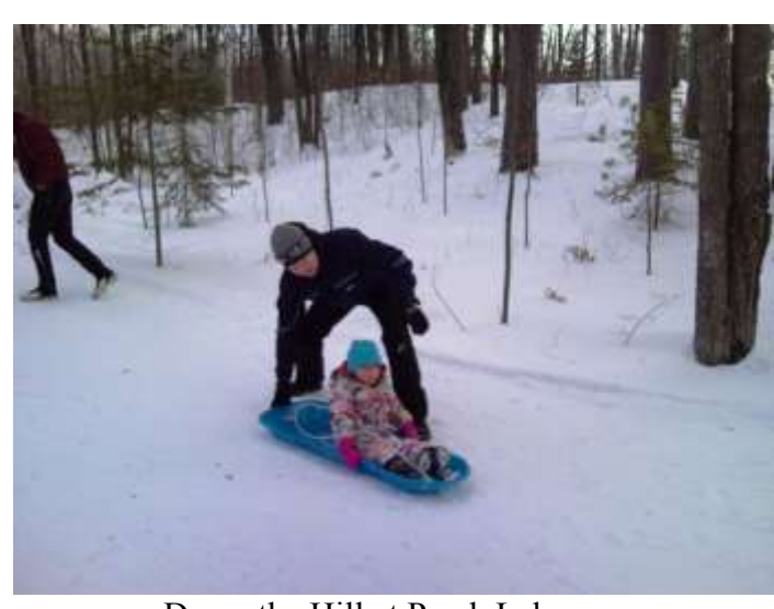
Down the Hill at Perch Lake