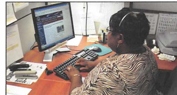
Researching Burial Information

The National Cemetery Scheduling Office is open 7 days a week from 7 a.m. to 6:30 p.m. Central Time. The Scheduling Office is closed Thanksgiving Day, Christmas Day, and New Year's Day. Interments at national cemeteries are conducted Monday thru Friday. When a federal holiday falls on a Monday or Friday, cemeteries will open for interments for one day over the holiday weekend as a service to Veterans and their families. The Scheduling Office will have the most current schedule of available interment times for each cemetery.