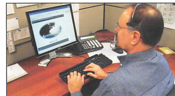
National Cemetery Scheduling Agent assisting a caller

The National Cemetery Scheduling Office is open 7 days a week from 7 a.m. to 6:30 p.m. Central Time. The Scheduling Office is closed Thanksgiving Day, Christmas Day, and New Year's Day. Interments at national cemeteries are conducted Monday thru Friday. When a federal holiday falls on a Monday or Friday, cemeteries will open for interments for one day over the holiday weekend as a service to Veterans and their families. The Scheduling Office will have the most current schedule of available interment times for each cemetery.