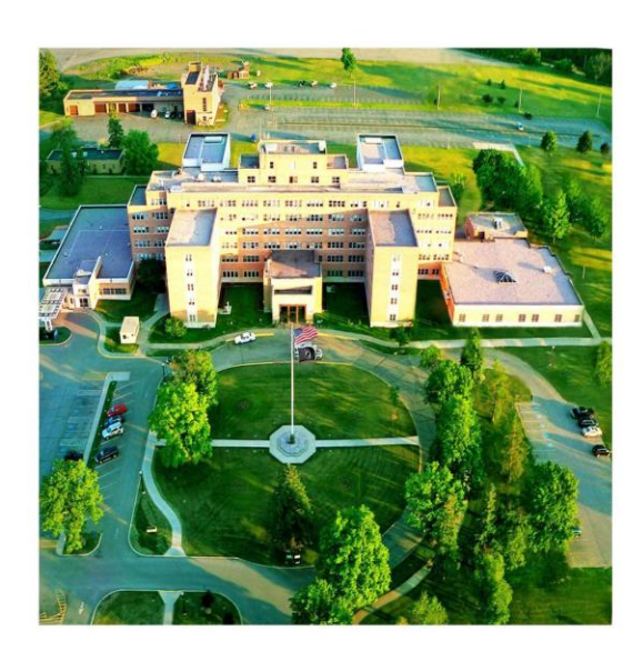
Oscar G. Johnson VA Medical Center 325 East H Street Iron Mountain, Michigan